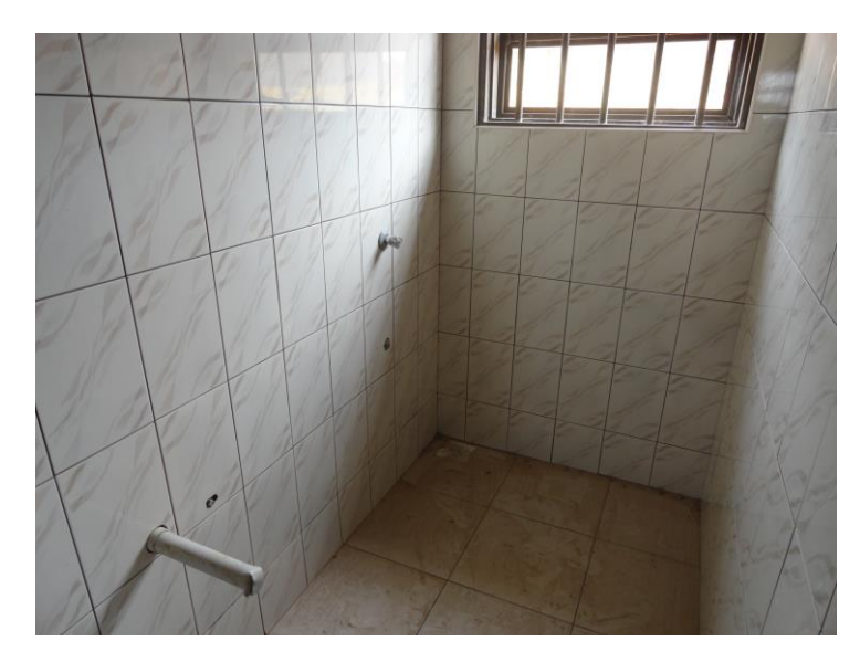
We have 368 square meters of the wall to cover which will cost us about $3,312 and 130 square meters of the floor which will require about $1,820 by the time we are done.

There is always a temptation to go the easier way round and call it cheaper, but we are aiming at permanency and a facility that will host people in a more comfortable and enjoyable way. So we seek the best deals and it often takes us longer time to land on the best materials and workers for the good deal so that each dollar is stretched.