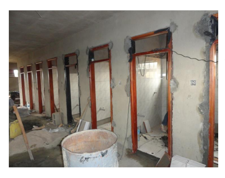
We are currently working on the last seven of the 16 door-frames – 7 bathrooms, seven toilets and two urinals.

With door frames in place, tiling work could begin in all the rooms. Floor and wall tiles are what we use here for durability and hygiene.